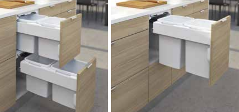
Two bin units: can be stacked to fit into a 350mm or 400mm cabinet.