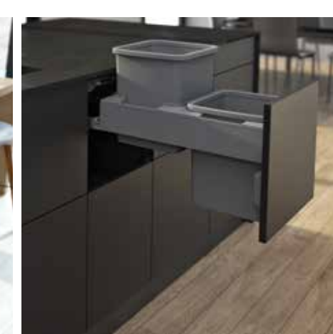
Over-extension runners allow easy access to rear bucket.