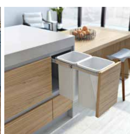
Mounting at bench height is ergonomic and convenient.